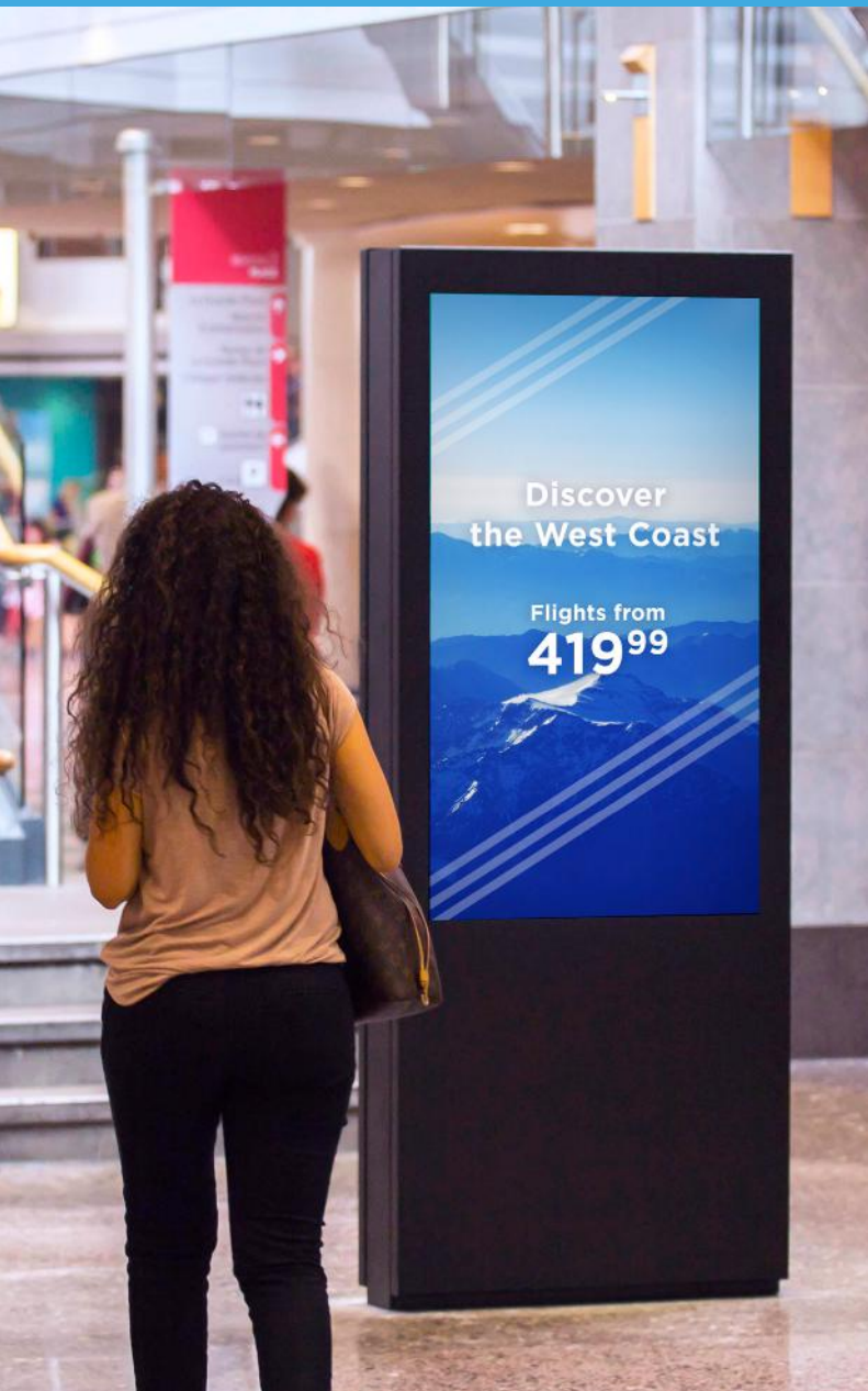
Positioned in common areas