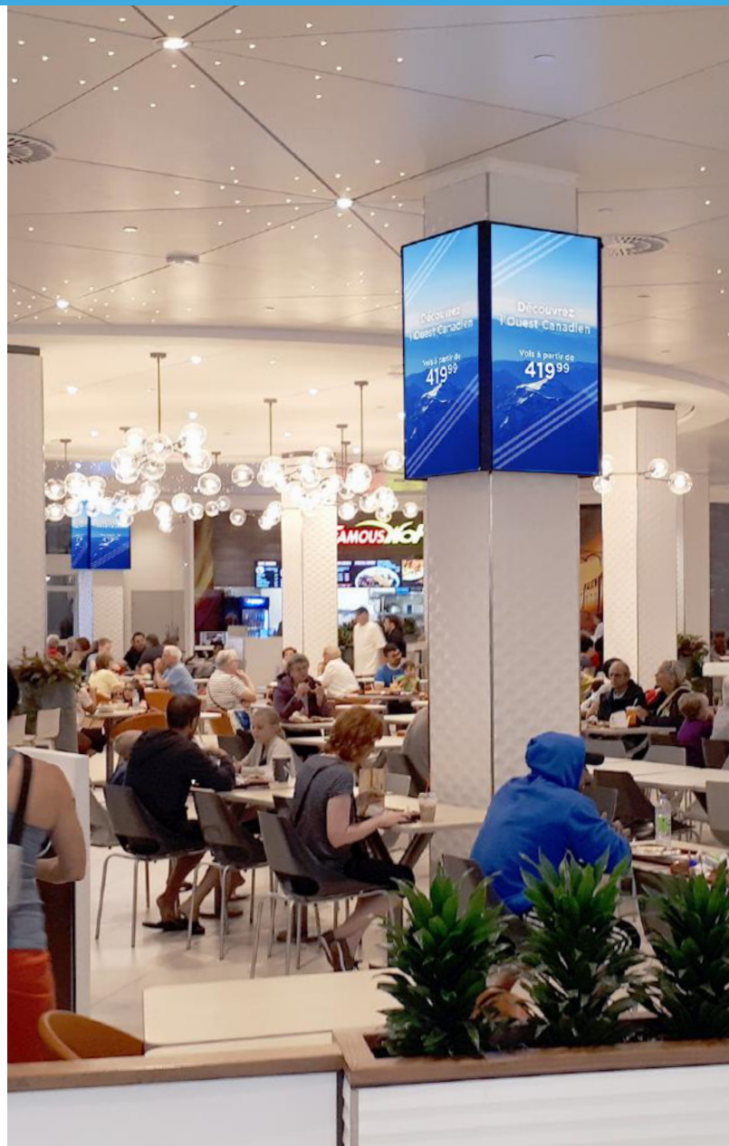
Positioned in restaurant areas

This document covers the production specs to build digital vertical ads. Best practices for producing effective and attractive visuals. What files to send our production team to build your ads in full-motion video. Uploading artwork to our WeTransfer page.