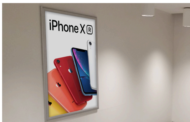
DIGITAL DISPLAY, STATIC DISPLAY

Alexis Nihon is a 2.4-million-square-foot urban complex located in downtown Montréal that beats to the rhythm of the 38,000 visitors, professionals and students who frequent it daily. Built in 1967, the year of the World Fair, Alexis Nihon is a multi-purpose business property featuring two office towers, a residential tower, a three-level shopping centre and indoor parking. With direct access to public transit (including Atwater metro station) and major expressways nearby, it is within walking distance of a number of important academic institutions and well-known residential and office towers.